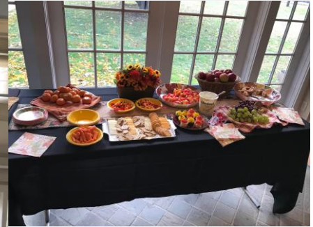
Let's look forward to when we are able to break bread together!